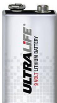
NEW Ultralife 9-Volt Lithium Battery